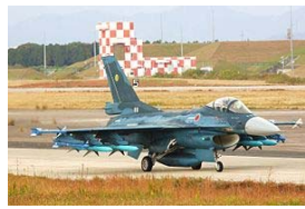
Structural material for fighter