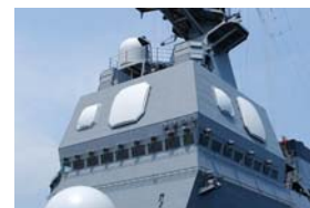
Rader for naval ship